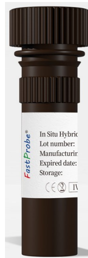
Product packing view

EU REP: Kingsmead Service B.V., Zonnehof 36, 2632 BE, Nootdorp, Netherland.