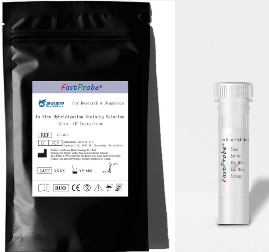
Product external (black bag) and internal (vial) packing view

EU REP: Kingsmead Service B.V., Zonnehof 36, 2632 BE, Nootdorp, Netherland.